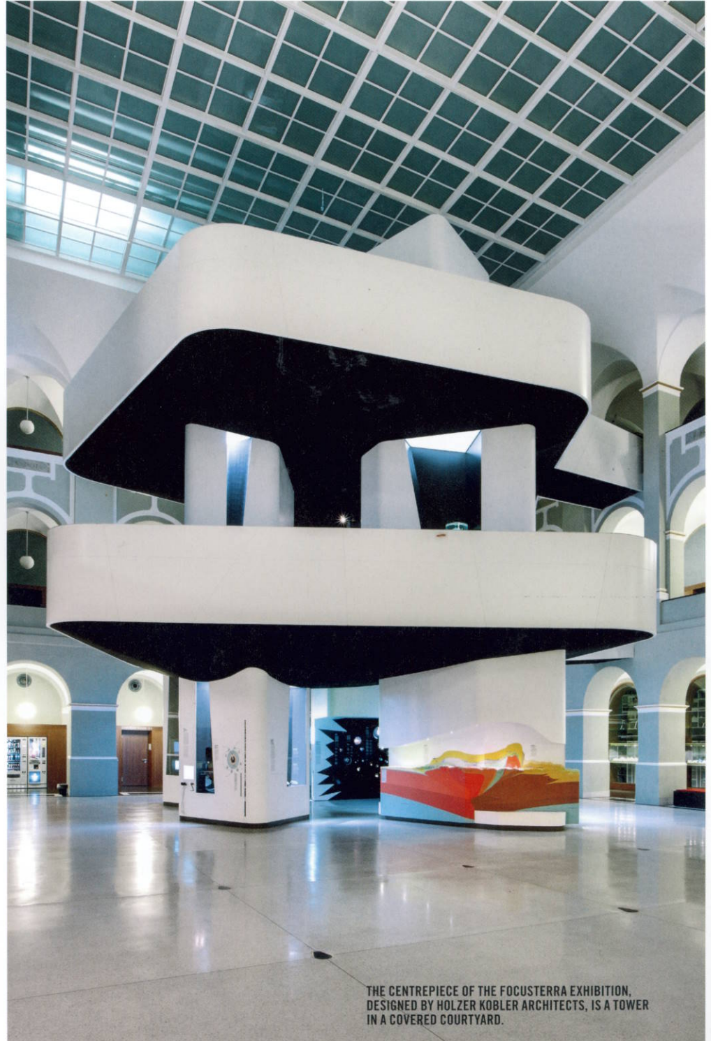
THE CENTREPIECE OF THE FOCUSTERRA EXHIBITION, DESIGNED BY HOLZER KOBLER ARCHITECTS, IS A TOWER IN A COVERED COURTYARD.